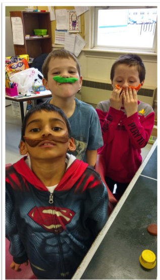
Kids play while they learn at Black's Harbour's summer literacy camps!